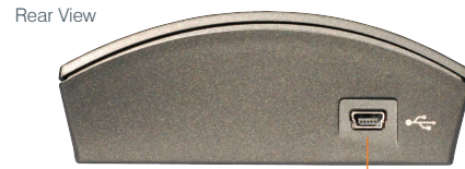
Rear View USB Port