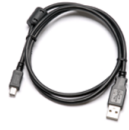
CHAT USB Cable 830-159-001