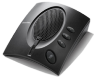
CHAT 70-U 910-159-257